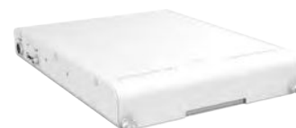
Medical Expansion Power Bank