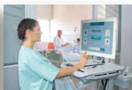
Daily Patient Management