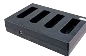
4 Bay Battery Charging Station