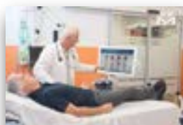
Medical & Healthcare