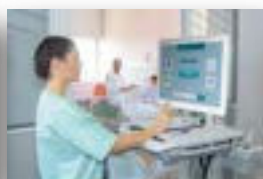
Daily Patient Management