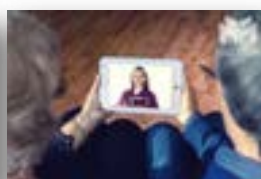
Remote Mobile Medical Service