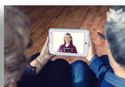
Remote Mobile Medical Service