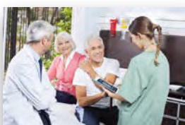
Medical & Healthcare