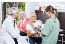
Medical & Healthcare