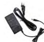
ADA19D3 Power Adapter DC 19V/ 3.78A/ 71.82W