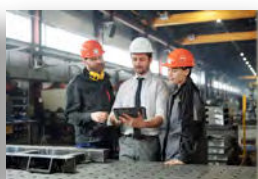
Industrial Operating System