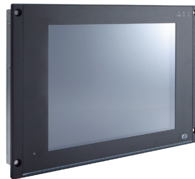
▲ Side view